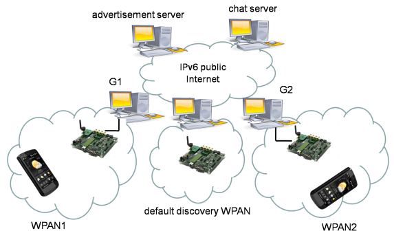
Fig. 2. Reference application scenario.

We conceived the application scenario depicted in figure 2.